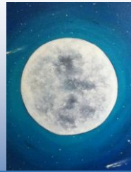
Marsha Stone, Artist

January 6, 2017 February 3, 2017 March 3, 2017 April 7, 2017 May 5, 2017 June 2, 2017